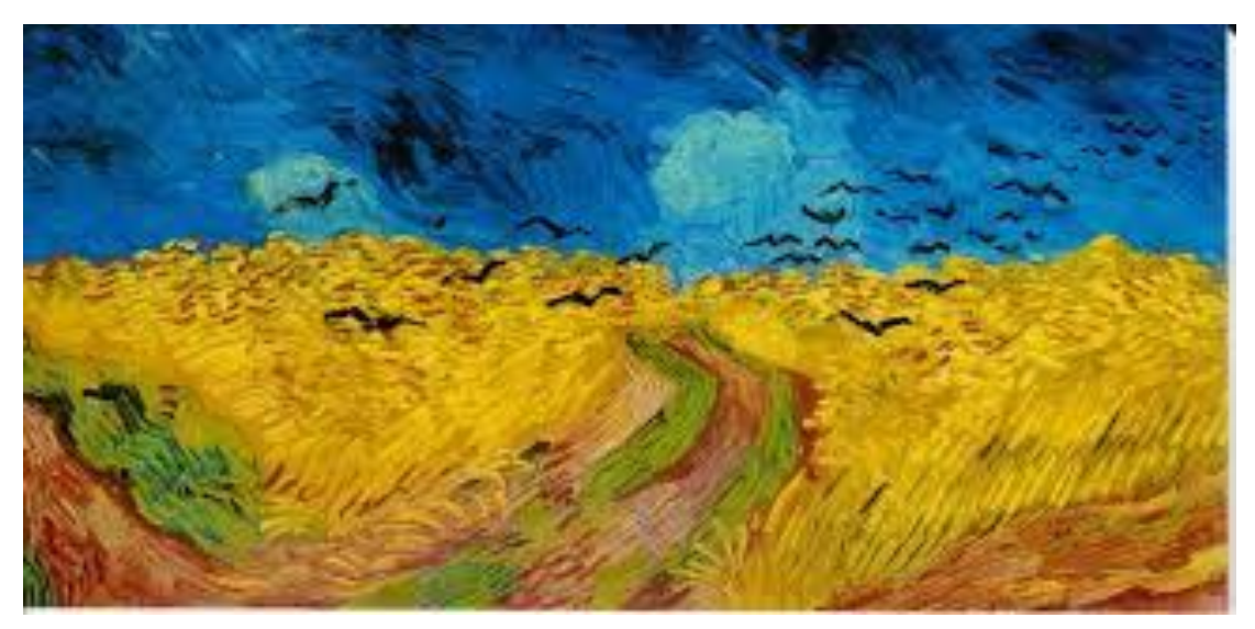
Figure 1 - Champ de blé aux corbeaux - Van Gogh

Between 2003 and 2017, Sandrine Mansour publishes many articles and books. She collaborates also in the elaboration of two documentary-films and a film still related with Palestine. She gives today political accompaniment and advises for the decentralised cooperation of the district Loire-Atlantique with Palestine.